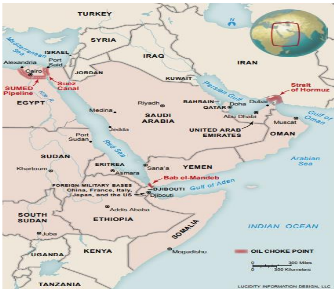
Figure 1: Broader Red Sea arena includes the Red Sea from the Arabian Peninsula, Egypt, all the way through the Horn of Africa. The strategic waterways include the Red Sea, the Bab el-Mandeb Strait, and Gulf of Aden. (United States Institute of Peace, 2020, p. 4).

The Indian Ocean holds various important SLOCs as well as maritime chokepoints, noticeably the Straits of Malacca, Hormuz, and the Bab el-Mandeb. A huge volume of global long haul cargo, primarily oil, from Africa, Europe, and Persian Gulf passes this ocean each year. (Sakhuja, 2008, p. 690) Oil and gas that travels through the Indian Ocean region is a big deal of the world's economy. The Indian Ocean region holds approximately 55 percent and 40 percent of oil and gas reserves respectively. Arab and Gulf states are home to 21 percent of the world's oil stock, reflecting approximately 43 percent of international exports worth 17,262 million barrels for a size of daily crude exports (Potgieter, 2012, p. 2). Small states such as the United Arab Emirates (UAE) and Qatar, as middle powers, in addition with external powers like China are competing for influence, access and market share in the region. As a consequence, it has also blurred the boundary between Middle East and Africa, creating new emerging trans-regional dynamics (Vertin, 2020, p. 4). To simplify the mentioned regions as a part of the Indian Ocean, this article refers to it as the 'broader Red Sea arena,' following the report made by the United States Institute of Peace titled "China's Impact on Conflict Dynamics in the Red Sea Arena".